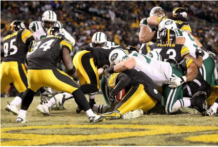
Ben Roethlisberger for 2 points please