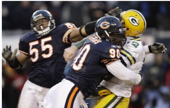
Give me Julius Peppers in your face for 15