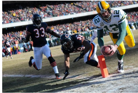
I'll take Aaron Rodgers for 6 please