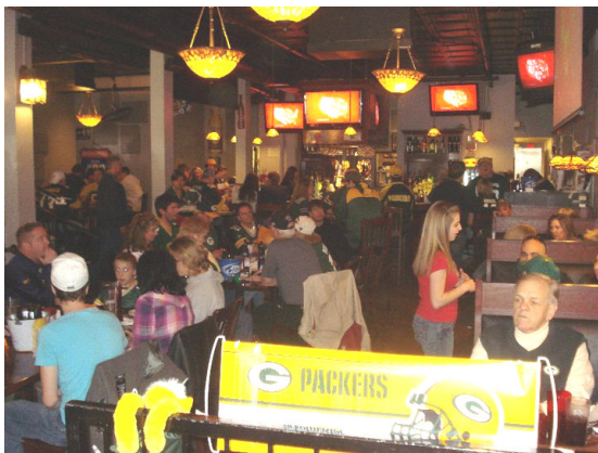
Greenville Packer Backers for a million Dollars