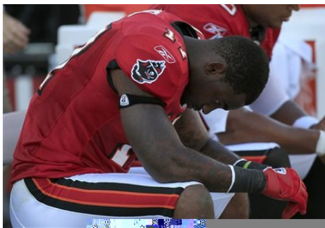
(Owners from page 1)