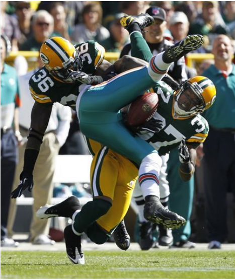
(Report Card from page 4)

and in the locker room, and a personal favorite. GRADE: A