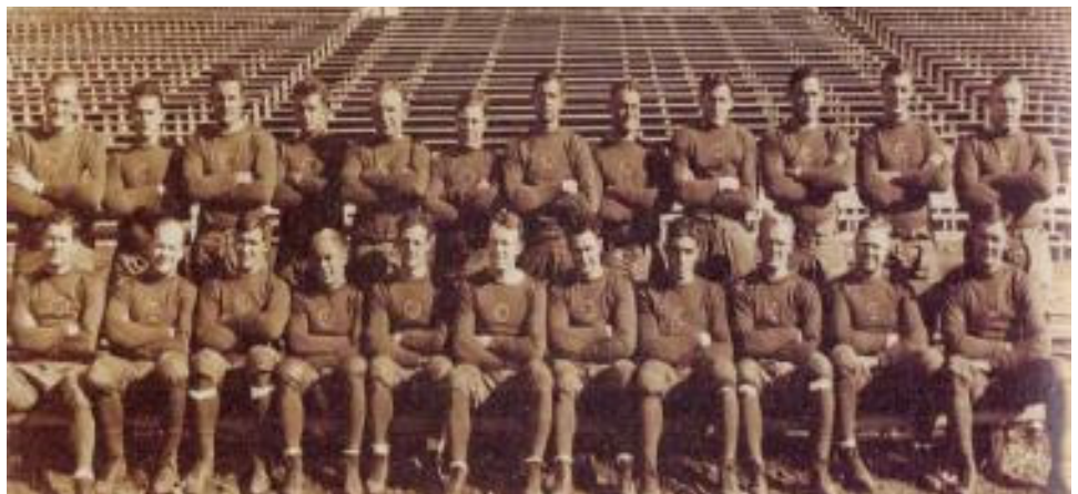
The 1929 Green Bay Packers Championship Team