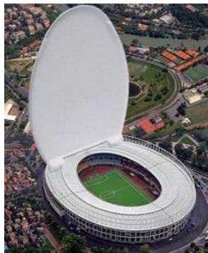
The Viqueens new stadium