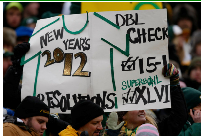
(FOTF from page 1)